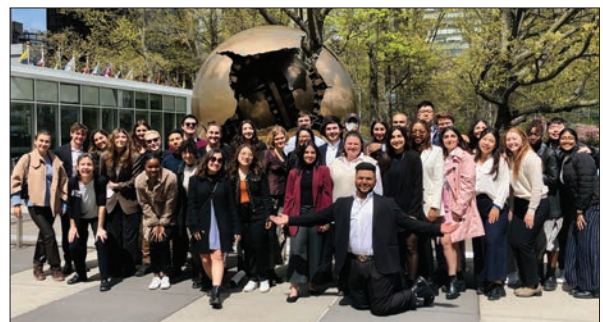
CISLA SCHOLARS VISITING THE UNITED NATIONS ON APRIL 27, 2022

In the pages that follow we detail some of the events, staffing updates, student reflections on their summer experiences, alumni news, and the impressive honors and awards of CISLA scholars who, despite the significant challenges of the past two years, continue to shine.